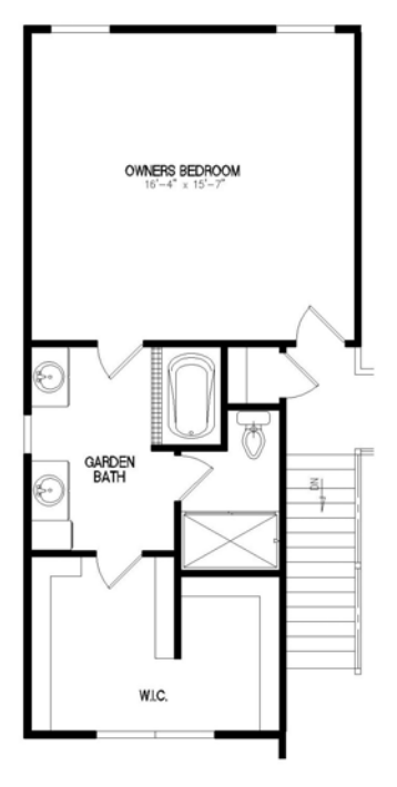
OPTION SECOND FLOOR GARDEN BATH