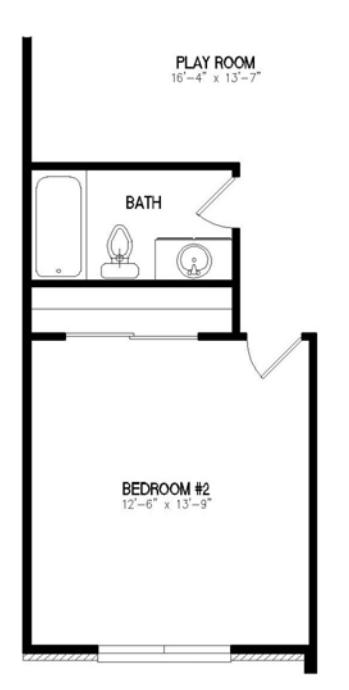
OPTION SECOND FLOOR BATH IN LIEU OF WIC