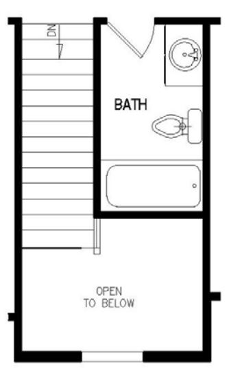
OPTION SECOND FLOOR BATH OVER ENTRY